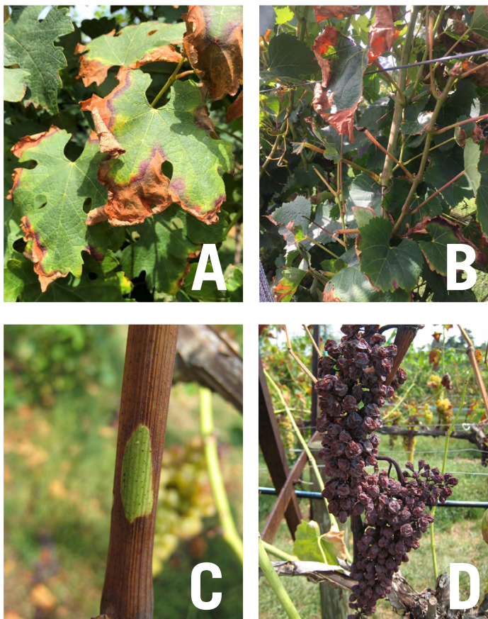
FIGURE 1. Pierce's disease symptoms include marginal leaf necrosis (A), leaf blade abscission from the attached petiole causing “match sticks” (B), “islands” of green tissue on primary grapevine shoots that are normally lignified and brown at this stage (C), and “raisins” (D).

and growing region. Scouting for PD should begin in mid-July in those regions. Symptoms will occur earlier in drought years, but symptoms are generally most evident from late August through September. In grapevines, Xf causes four visual symptoms that together are strongly associated with PD. Leaf necrosis is observed on the margins of leaves (Figure 1A). Marginal leaf necrosis can be a common response to several vineyard issues; its presence alone should therefore not alarm growers. However, growers are encouraged to contact local Extension agents if the following symptoms are observed in tandem with marginal leaf necrosis. “Matchstick” is the term used to describe the symptom that occurs when only the leaf blade abscises and the petiole (leaf stem) remains attached to the shoot (Figure 1B). “Green islands” describes the phenomenon observed when the shoot tissues harden off unevenly, resulting in green, vegetative “islands” within the brown, woody tissue (Figure 1C). Lastly, as the xylem flow is increasingly blocked by bacteria, infected plants will also form “raisins” as the fruit clusters dry out from lack of translocated water (Figure 1D).