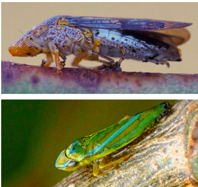
FIGURE 4. Glassy-winged sharpshooter (top) and versute sharpshooter (bottom).

sharpshooter breeding and feeding habitat, but several other problems related to the maintenance of soil structure and erosion prevention arise if the vineyard floor is barren of grasses. An indirect way of managing Xf -positive vectors would be to limit the number of Xf -harboring plants near vineyards. The difficulty lies in determining the plants that are worth managing as (1) many plants that harbor Xf are asymptomatic; (2) Xf multiplies and spreads to different extents across species and results in some plants being “better” inoculum sources than others; and (3) insect vectors may not feed on all Xf -positive plants (Varela et al., 2001). Application of insecticides, particularly systemic insecticides, from the time of vector detection in the spring is advised (Krewer et al., 2002). Glassy-winged sharpshooters often feed on the base rather than on the tips of canes, as well as on 2-year-old wood. Thus, early-season through mid-season management is particularly important, since early infections are more likely to lead to movement of bacteria to the cordon and trunk, where bacteria will not be removed through pruning practices (Feil et al., 2003). UGA Extension Circular 1151 (Hickey et al., 2022), Viticulture Management , is a poster offering a visual reminder and reference for sharpshooter scouting and management throughout the seasonal grapevine growth stages.