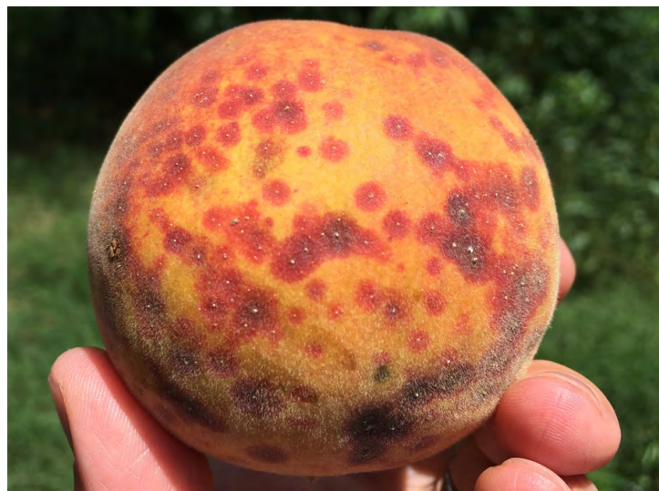
Figure 4. San Jose scale damage on a peach fruit.

Even after applying two dormant sprays with horticultural oil, additional within-season San Jose scale management may be necessary in many areas of Georgia. Because horticultural oils have the potential to burn leaves and damage fruit, within-season management focuses on insecticides targeting the scale crawlers. While San Jose scale crawlers can be found on trees nearly all season long in Georgia, there are three distinct peaks of activity we can target to maximize our management efficacy. These peaks are generally early May, late June, and mid-August, but because San Jose scale development is dependent on climate, the yearly variation in temperature