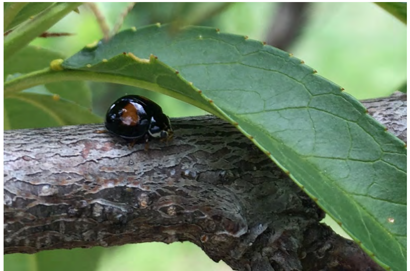
Figure 7. Example of a lady beetle adult feeding on San Jose scale on a peach branch.

There are a number of predators and parasitoid wasps that feed on or attack San Jose scale (Figure 7). These insect natural enemies may help naturally reduce scale populations in the Southeast, but generally they do not provide enough control to prevent damage when scale populations are high. At this time, natural control is only considered a supplement to chemical control. Note that using insecticides, particularly pyrethroids, during the growing season can significantly impact natural enemies, disrupting the natural control of many orchard pests, San Jose scales, and mites.