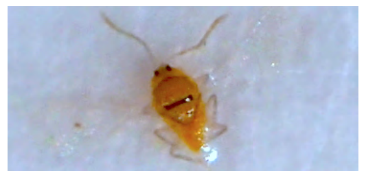
Figure 1. Example of A) an adult female with her protective covering removed and B) a winged male.