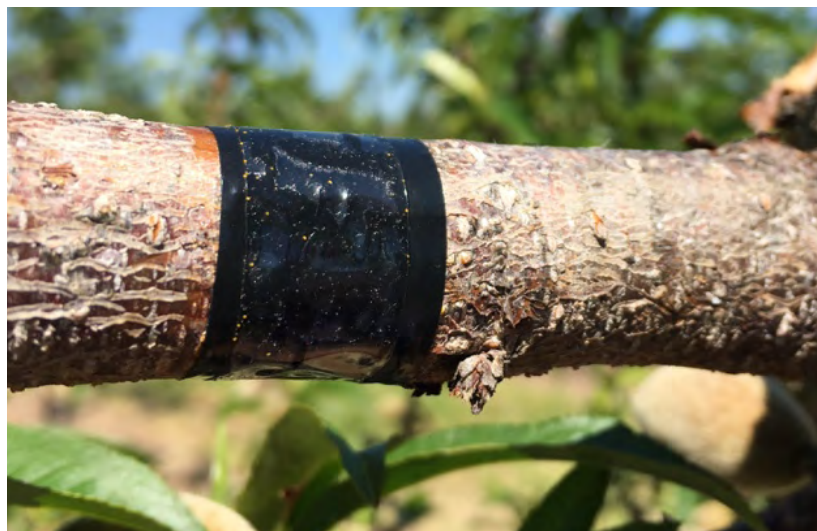
Figure 6. Monitoring trap for sampling San Jose scale crawlers.

In addition to growing degree-days, targeting San Jose scale crawler activity can be improved by visually monitoring for crawlers on infested trees. Crawler activity can also be assessed by regularly checking new shoot growth in infested trees, as the crawlers will be concentrated on new growth. To monitor crawler activity, create a trap by wrapping scale-infested branches first with black electrical tape and then clear double-sided sticky tape (Figure 6). Using a hand lens or loupe, check the tape for scale crawlers frequently. While there is no threshold to initiate spray timing, plan to target management when the number of scale crawlers caught on the tape traps substantially increases.