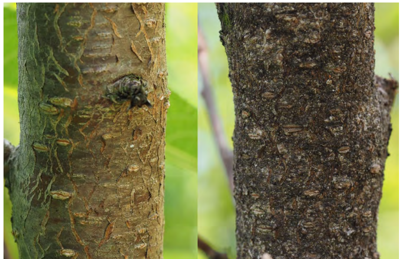
Figure 3. Comparison of similarly aged peach tree limbs, A) healthy, uninfested and B) infested with San Jose scale.

Scales damage plants directly through feeding injury or indirectly through the production of honeydew that can result in sooty mold growth on leaves and fruit. Scales feed by inserting their piercing/sucking mouthparts and withdrawing nutrients directly from the plant. In peaches, feeding damage can cause leaf chlorosis, twig or limb die-back, or even tree death if scale populations reach high levels. At high enough populations, San Jose scales cover branches, creating a bumpy, gray, “scaly” surface compared to the smooth brown bark of an uninfested branch (Figure 3). San Jose scales prefer to feed on branches, but at high populations, the crawlers settle and